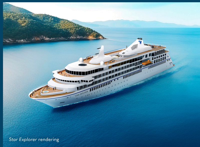
Star Explorer rendering

Access to board ship is via stairs only. Access to/from outside deck may require assistance with doors and thresholds.