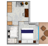
TRIPLE PREMIER VERANDA SUITE