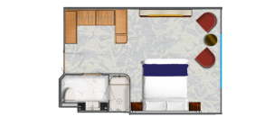
VISTA INFINITY SUITE