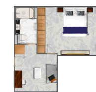
TRIPLE INFINITY SUITE