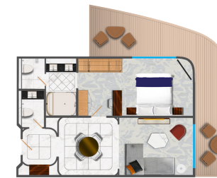
HORIZON OWNER'S SUITE