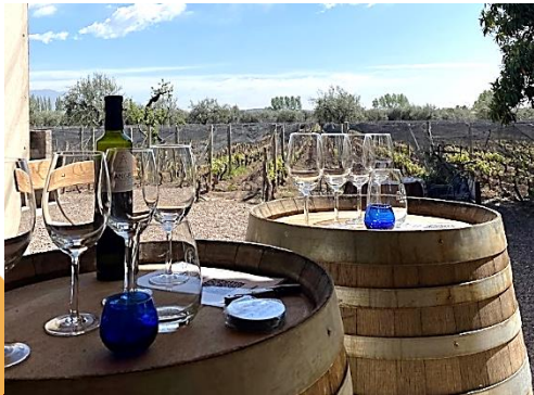
De Angeles Viña 1924