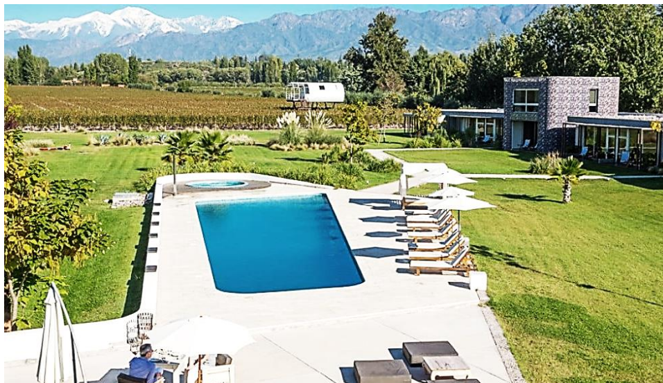
Entre Cielos Hotel