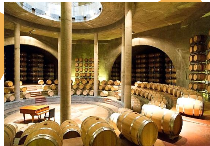
Zuccardi Valle De Uco