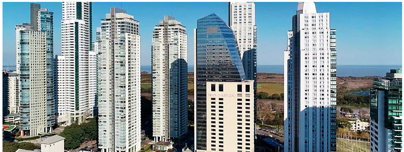
Alvear Icon Hotel