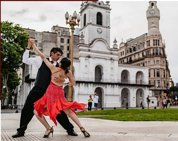
Tango origins 18 th century Buenos Aires