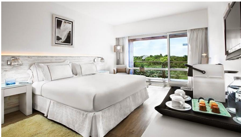
Jungle View - Included