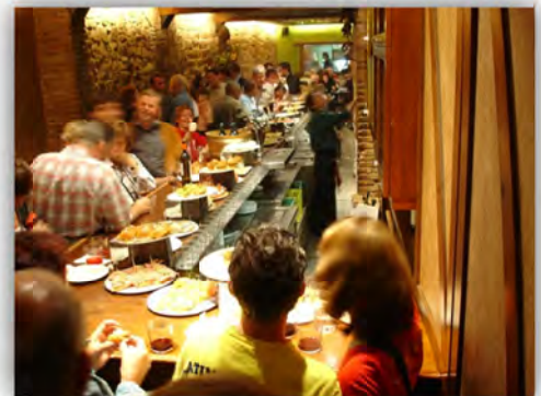
BARCELONA TAPAS BAR

It has been said that Spain owes much of its status as a mecca of progressive cuisine to these small plate dishes; Spaniards will try anything once – as long as it's small! Join your knowledgeable, English-speaking guides midday for an introduction to the local cuisine that welcomes the new, while celebrating the old— tapas! At each stop along your route there will be a glass of wine and one of these famous, small plates waiting. The two and one half hour walking tour ends back at Hotel Colón. You will have some free time to relax this afternoon before joining your hosts for a welcome dinner tonight at 7 Portes, one of the oldest and most emblematic restaurants in Barcelona.