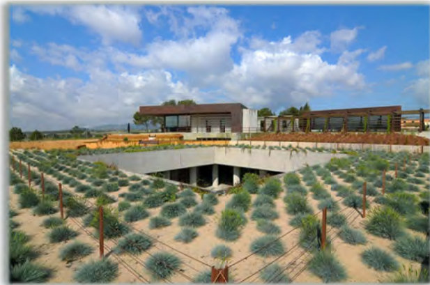
PACS DE PENEDES – FAMILIA TORRES

Buffet breakfast is included this morning in the hotel restaurant. Following breakfast, you will meet your guide in the hotel lobby and depart for the Penedés wine region.