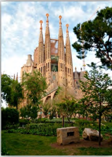
GAUDI'S SAGRADA FAMILIA

Our four-hour city tour of Barcelona will take you to one of the city's most celebrated attractions, Gaudi's famous unfinished cathedral, Sagrada Familia . Sagrada Familia is one of Gaudi's most impressive works. This enormous church is a summary of everything that Gaudi designed. The architectural style of Sagrada Familia has been called "warped Gothic," and it's easy to see why. The rippling contours of the stone façade make it look as though Sagrada Familia is melting in the sun, while the towers are topped with brightly-colored mosaics which look like bowls of fruit.