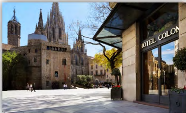
HOTEL COLÓN, BARCELONA SPAIN

Food & Wine Trails' Barcelona pre-cruise package offers guests the opportunity to experience and taste the Spanish Food, Wine & Architecture of Barcelona. This package includes three nights at the four-star Hotel Colón , conveniently located in front of the city's cathedral and just a few steps away from Las Ramblas . A one-night pre-cruise package is also available for those desiring an overnight stay and highlights of the city prior to starting their journey at sea.