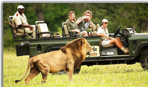
GAME DRIVES WITH MALA MALA GAME RESERVE

Mala Mala Game Reserve consistently brings the most exciting wildlife experience this side of the equator! The oldest and largest private game reserve in South Africa stretches across 33,000 acres and shares a 12-mile unfenced border with Kruger National Park, home to the coveted "Big Five": lion, leopard, rhinoceros, elephant, and Cape buffalo, as well as an array of other wild animals.