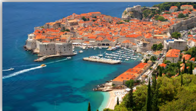
UNESCO HERITAGE CITY OF DUBROVNIK

Dubrovnik is also famous for its great beauty and tragic past. On a guided walking tour, delve into its magical ambiance and tantalizing stories. Begin at the city's famous main street, the Stradun, and wander through centuries old cobblestone streets. Visit historic sites including the famed Sponza and Rectors Palaces, Onofrio's fountain, and the beautifully decorated Romanesque Cathedral. In 1979 Dubrovnik was designated as a UNESCO World Heritage Site. After witnessing the pristine condition of the city and its buildings, you will be amazed to learn that it was twice devastated, once by earthquake in 1667 that leveled the town, and then again in 1991 by bombs during the Yugoslavian civil war.