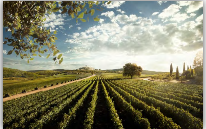
ORNELLAIA'S BELLARIA VINEYARD

From there, continue on to one of the most celebrated Tuscan wine estates, Tenuta dell'Ornellaia , and discover for yourself what compels the wine industry's top publications to include their wines in their annual list of 'top wines' over and over, year after year. Your visit begins with a walking tour through the estate's famed Bellaria Vineyard , stand under its 150-year-old oak tree and hear the history of this beautiful and unspoiled land. A land that has become synonymous with winemaking of the first order and has seen the birth of such great labels such as: Ornellaia , Le Serre Nuove dell'Ornellaia , Masseto and Le Volte . Here, the winemaking philosophy is " quality without compromise ," and you will experience this integrity first-hand during a tasting of several of their varietals, followed by a traditional Tuscan four-course lunch at the winery paired with a selection of current releases.