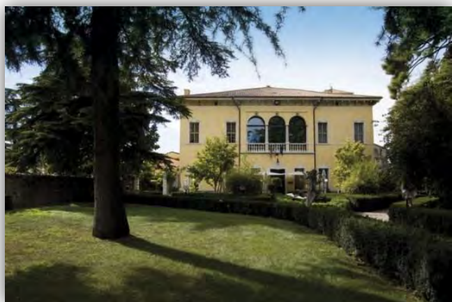
VILLA QUARANTA TOMMASI HOTEL