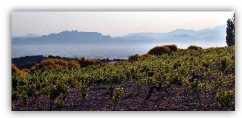
VINEYARDS OF CHÂTEAUNEUF-DU-PAPE

PORT: MARSEILLE, FRANCE | SATURDAY, OCTOBER 5, 2019 | 8:15 AM - 5:00 PM*