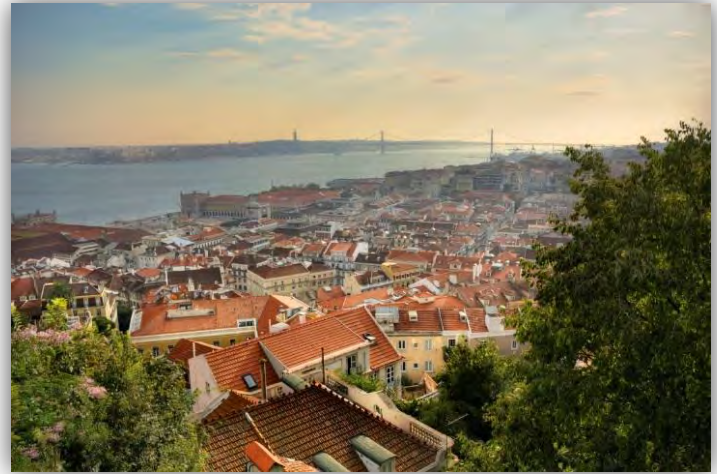
PORTUGAL'S CAPITAL CITY, LISBOA

A city set on seven hills, the Portuguese capital of Lisbon has a history longer and richer than any other European city. Facing the river Tagus, connected by the stunning bridge that reminds us of San Francisco's Golden Gate, the charm of Lisbon exists in its strong links to the past. Its renovated palaces, magnificent churches and an impressive castle mirror the city's rich cultural heritage. The labyrinth of streets that crisscross the city's historical center with its tile covered buildings are unique in the world.