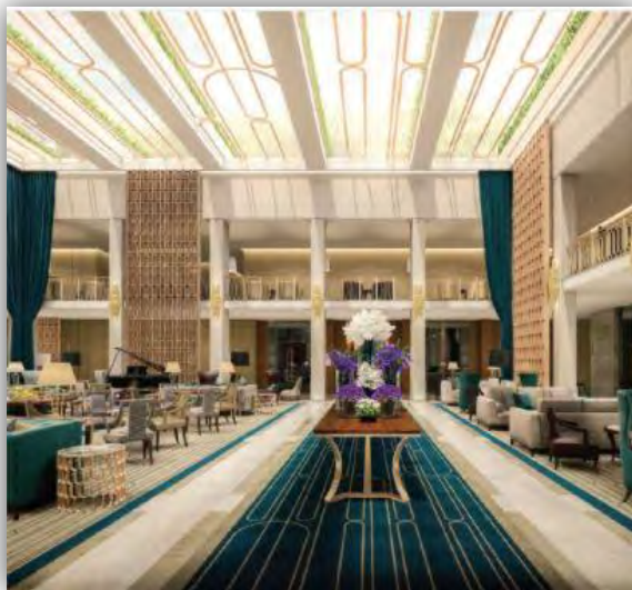
TIVOLI AVENIDA LIBERDADE LISBOA

We invite you to join your fellow cruisers two nights early, and discover this beautiful city and one of its nearby wine regions. Spend a day in the Portuguese DOC winemaking district of Alenquer and sample some of the wines that make this region special. This pre-cruise option includes two nights in a city center 5-star hotel, a welcome dinner and Fado performance, visit to a 17th century palace, and an excursion to an Alenquer winery with a tour, tasting and a wine-paired lunch hosted by one of the region's premier wine families. Your stay in Lisbon also includes a guided city tour and a private transfer to the ship on embarkation day.