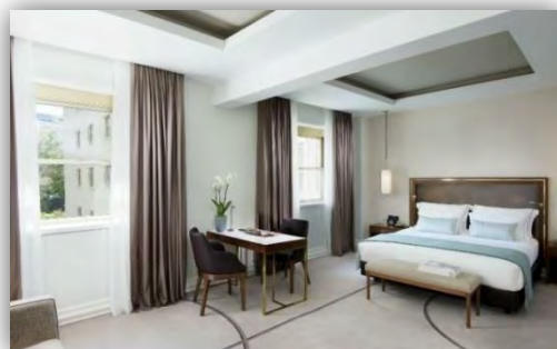
DELUXE AVENUE VIEW ROOM

Independent Room Nights: $ 357 per night