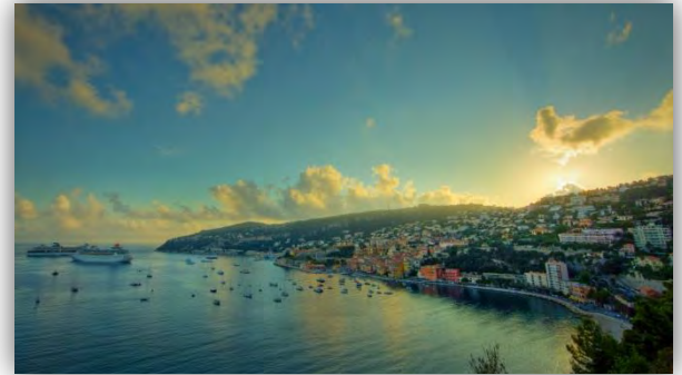
THE CÔTE D'AZUR

The Côte d'Azur, also known as the French Riviera, is one of Europe's most glamorous summer holiday destinations. It twists and turns along the southern coast of France for a little less than 100 miles, and is dotted with glitzy legends such as St. Tropez and Cannes. The heart of the Côte d'Azur lies in the city of Nice and in the hills just behind is the appellation of Bellet . Here the vineyards are terraced and the soil is full of pebble stones, sand & clay. The area is kissed by the sun and benefits from fresh winds from the Alps and, in the afternoon, humid winds from the sea.