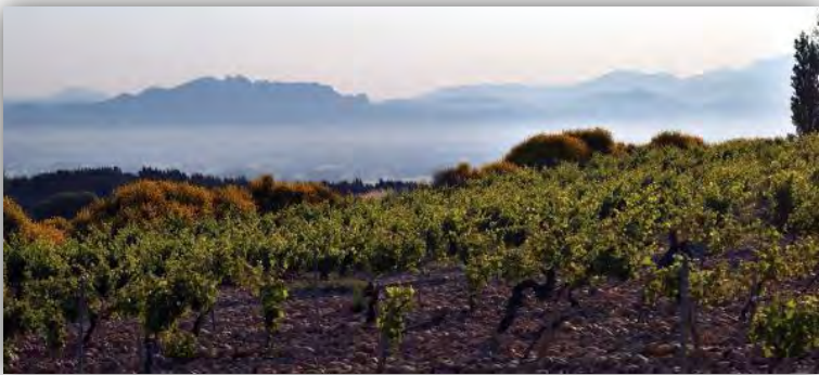
VINEYARDS OF CHÂTEAUNEUF-DU-PAPE

PORT: AVIGNON, FRANCE | MONDAY, OCTOBER 21, 2019 | 11:30 AM – 6:00 PM*