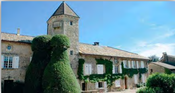
CHÂTEAU DE FUISSÉ