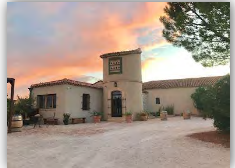
DOMAINE DE LA MORDOREE

Your next winery stop is Domaine de la Mordorée . This relatively recent estate was founded by the Delorme Family in 1986 with only 12 acres of vines in Châteauneuf-du-Pape. Today they make wines from over 120 acres of vineyards over 38 plots and 5 appellations. Here you will discover more in depth the terroir of their appellations, their unique approach to winemaking and most importantly, their delicious wines! Your guided tasting will cover a selection of their best reds, whites and rosés from Châteauneuf-du-Pape, Lirac and Tavel which is considered by many as the best rosé in France. Following your tasting you will return directly to the ship.