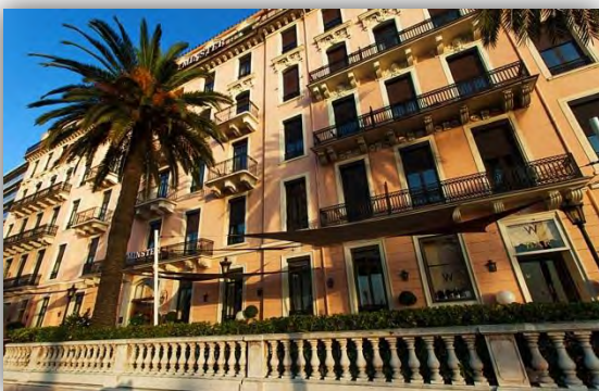
WESTMINSTER HOTEL & SPA