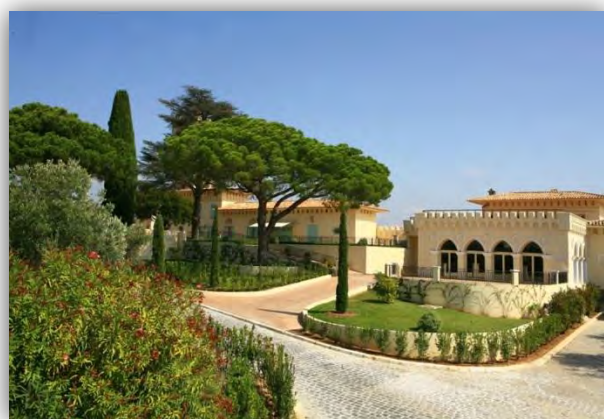
CHÂTEAU DE CRÉMÂT