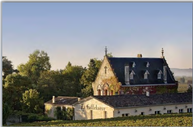
CHÂTEAU LA GAFFELIERE

Winemakers from all over the world have credited the wines of Bordeaux for influencing their personal winemaking style. Food & Wine Trails has designed a special experience at three châteaux that produce Grand Cru Classé reds in the Saint-Émilion appellation, considered by some to be the “Capital of Merlot” and possibly the oldest, active wine producing appellation in the region with history dating back to the ancient Romans.