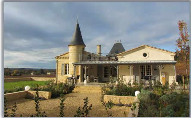
CHATEAU DE CANDALE