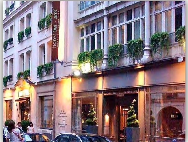
THE HOTEL BEL AMI IN PARIS

You are invited to meet your fellow group members in Paris early for a three night pre-cruise program, where you'll stay in a charming, art-design hotel on Paris' historic Left Bank. You'll enjoy a group welcome dinner, a day tour of the French winemaking region of Champagne, and an entire day to explore Paris on your own. From Paris, you'll take a high-speed TGV train to Lyon, where you'll begin your river cruise.