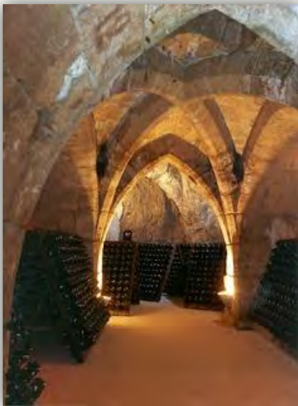
THE CAVES OF TAITTINGER