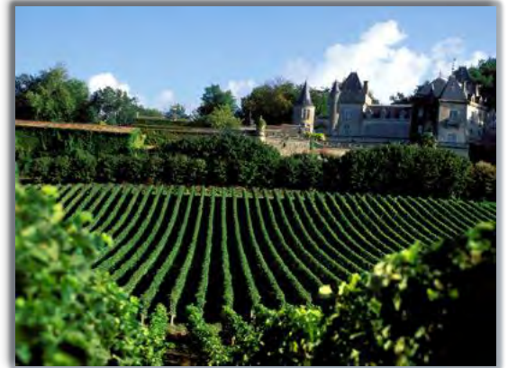
ST EMILION VINEYARDS

For generations, Bordeaux has been known as the most famous winemaking region in the world. Every year, wine lovers from all over the world come to Bordeaux for one simple reason: to visit the 300,000 acres of vineyards that lie outside town and stretch for miles in every direction. And no matter which direction you go, there's an appellation—from the classic reds of the Médoc to the underappreciated whites of Graves and Entre-Deux-Mers; from the unparalleled dessert wines of Sauternes, to the rising reds of the Right Bank's Pomerol and Saint-Émilion.