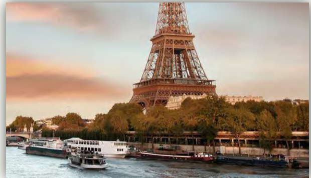
SCENIC BOAT RIDE ON THE SEINE

Today is your day to explore Paris on your own. Visit the Louvre , the Musée d'Orsay , walk along the Ile Saint-Louis , stroll the Champs-Élysées , see the Arc de Triomphe , take a scenic boat ride on the Seine on one of the bateaux mouches , window shop on Rue Saint-Honoré , or visit Paris' most beloved monument—the Eiffel Tower . The day and evening are yours—so enjoy!